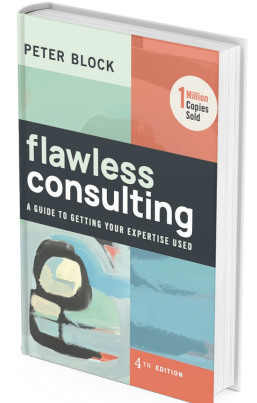
Peter Block's bestselling book Flawless Consulting is often called 'The Consultant's Bible.'

...and anyone who needs to influence horizontally and vertically within and across organizational boundaries.