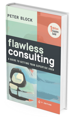
Peter Block's bestselling book Flawless Consulting is often called 'The Consultant's Bible.'